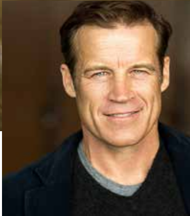
MARK VALLEY Films

In a previous career Mark served with the US Army in Berlin and in the Gulf War after graduating from West Point. With the Cold War ended Mark took his efforts to the stage and became a versatile and reliable performer known for bringing a comedic angle to dramas as a lead or regular on network television shows like Boston Legal, Harry's Law, Keen Eddie, and Human Target. Valley is also the creator of the award winning web series Zburg, and his espionage-based podcast The Live Drop. He's published short stories and has written television pilots now in development. Currently Valley's producing a documentary called Red Elvis for Curiosity Stream about the American performer Dean Reed. When not working he's occasionally cycling through France on his new Peloton. Based in Los Angeles, he spends his time there and his upstate New York hometown on the Canadian border.